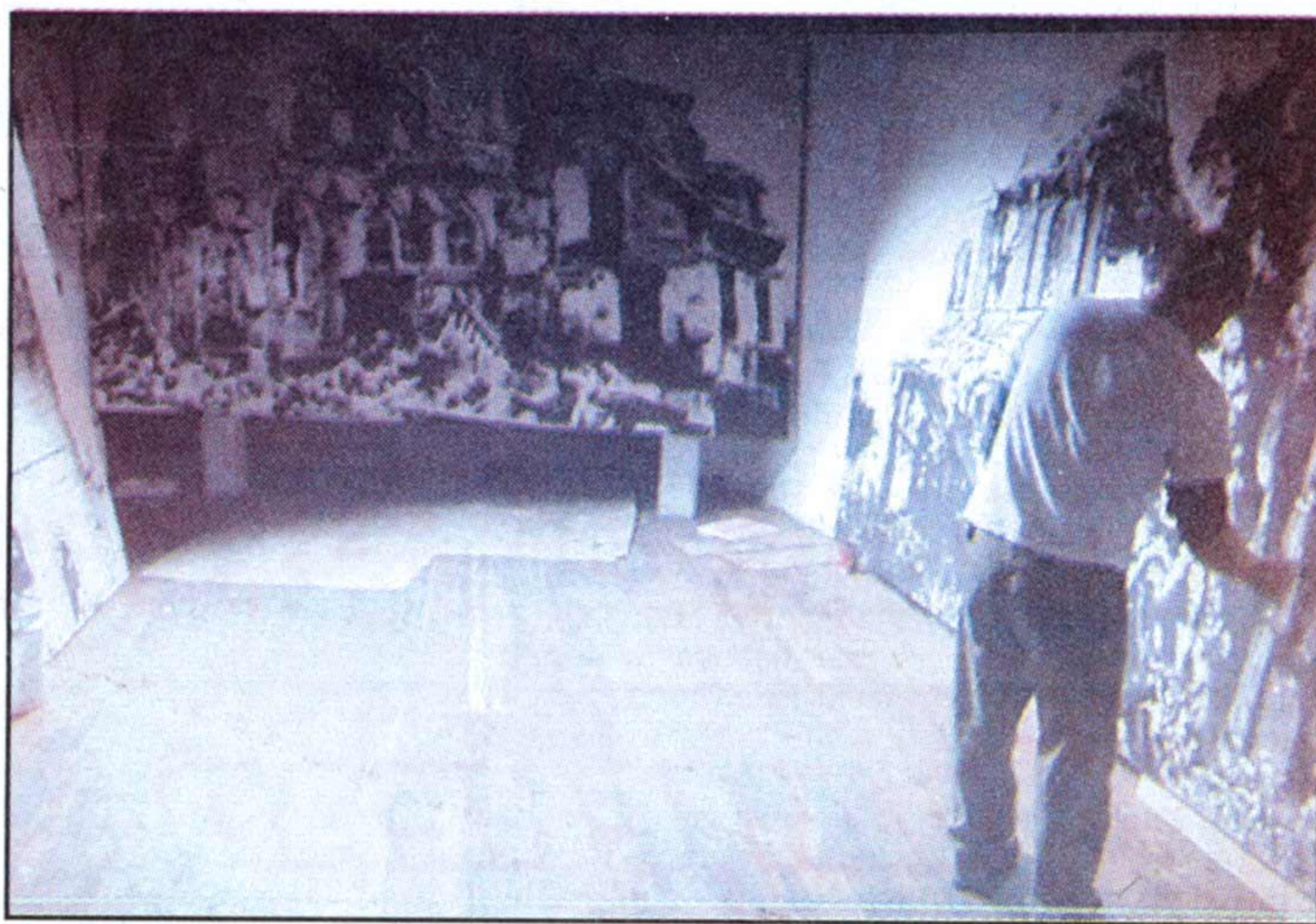
A still image from the Marc Seguin documentary film at Definitely Superior Art Gallery.