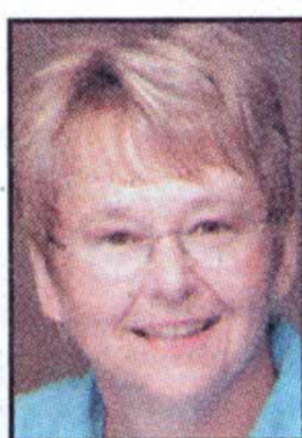
ON THE ARTS